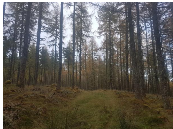
Example of mapped path becoming overgrown

Map: Scale 1:7500, 5m contour interval. Minor updates by Johannes Petersen November 2017. Only the most prominent rides and recent extraction lanes are mapped. There are many other faint rides and older overgrown extraction lanes which are not mapped. In addition, some of the main paths are becoming overgrown.