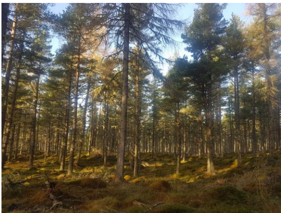
Typical Craig Leach Terrain

Planner's Comments: We are grateful to Dochfour Estate for permission to hold this event in the best part of Craig Leach. This is an area of mature, well-spaced pine forest with a beautiful wild feel about it. Optimal route choices will cross very little felling or windblow. Underfoot the going is mostly good, giving many sections of faster running.